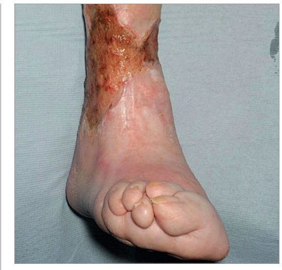
Figure 1. Venous leg ulcer in a patient with RA

synovial membrane that lines the joint, resulting in erosion of the bone (Firth et al, 2008).