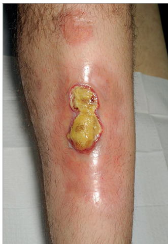
Figure 3. Active NLD lesion

most important role in the pathogenesis of NLD. Whereas glycoprotein deposition on the vascular wall of skin capillaries due to the underlying diabetes results in the lower oxygen tension within the lesion (Basoulis et al, 2015). There is a school of thought that views NLD as a primary disease of collagen with inflammation occurring as a secondary event (Mazur et al, 2011).